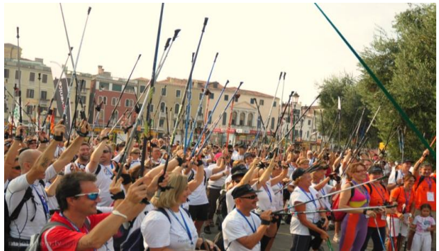
Nordic Kiwi Nordic Walking is planning a guided Nordic Walking tour of London, Venice & Barcelona in 2014. Please contact us to register your interest!

An estimated 60,000 tourists visit this iconic area, every day. The routes took us away from the heavy tourist areas of San Marco Square and the Rialto Bridge. We found ourselves in parts of Venice that the tourists do not go (unless they are lost). The participants were mainly from Italy, Germany and Spain but there were other languages and accents sprinkled throughout the groups, including two Kiwis!